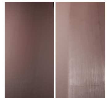
EVEREST National Brand

Burnishing can quickly degrade a painted surface, leaving behind an unsightly polished look. The advanced formula of EVEREST paints provides superior resistance to withstand the effects of consistent abrasion and contact.