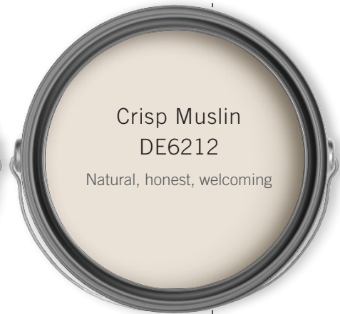
Crisp Muslin DE6212 Natural, honest, welcoming