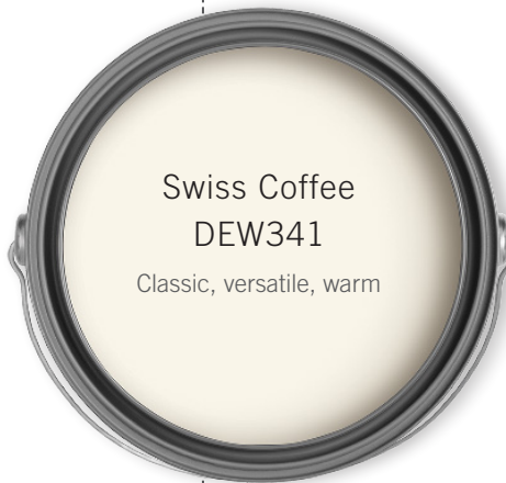
Swiss Coffee DEW341 Classic, versatile, warm

The Instant Designer Collection is your go-to palette for effortless beauty and lasting style. This exclusive collection was hand-selected by interior design experts to give you picture-perfect results in no time.