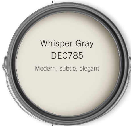
Whisper Gray DEC785 Modern, subtle, elegant