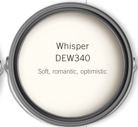
Whisper DEW340 Soft, romantic, optimistic