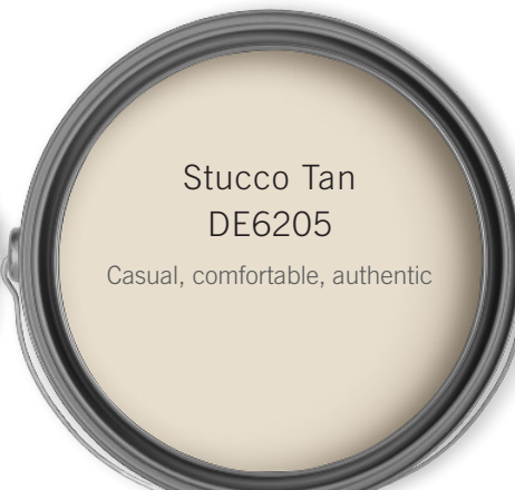
Stucco Tan DE6205 Casual, comfortable, authentic