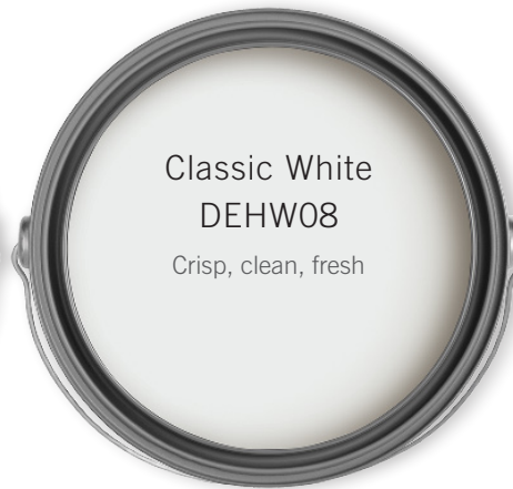
Classic White DEHW08 Crisp, clean, fresh