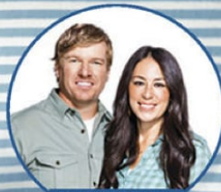
CHIP & JOANNA GAINES