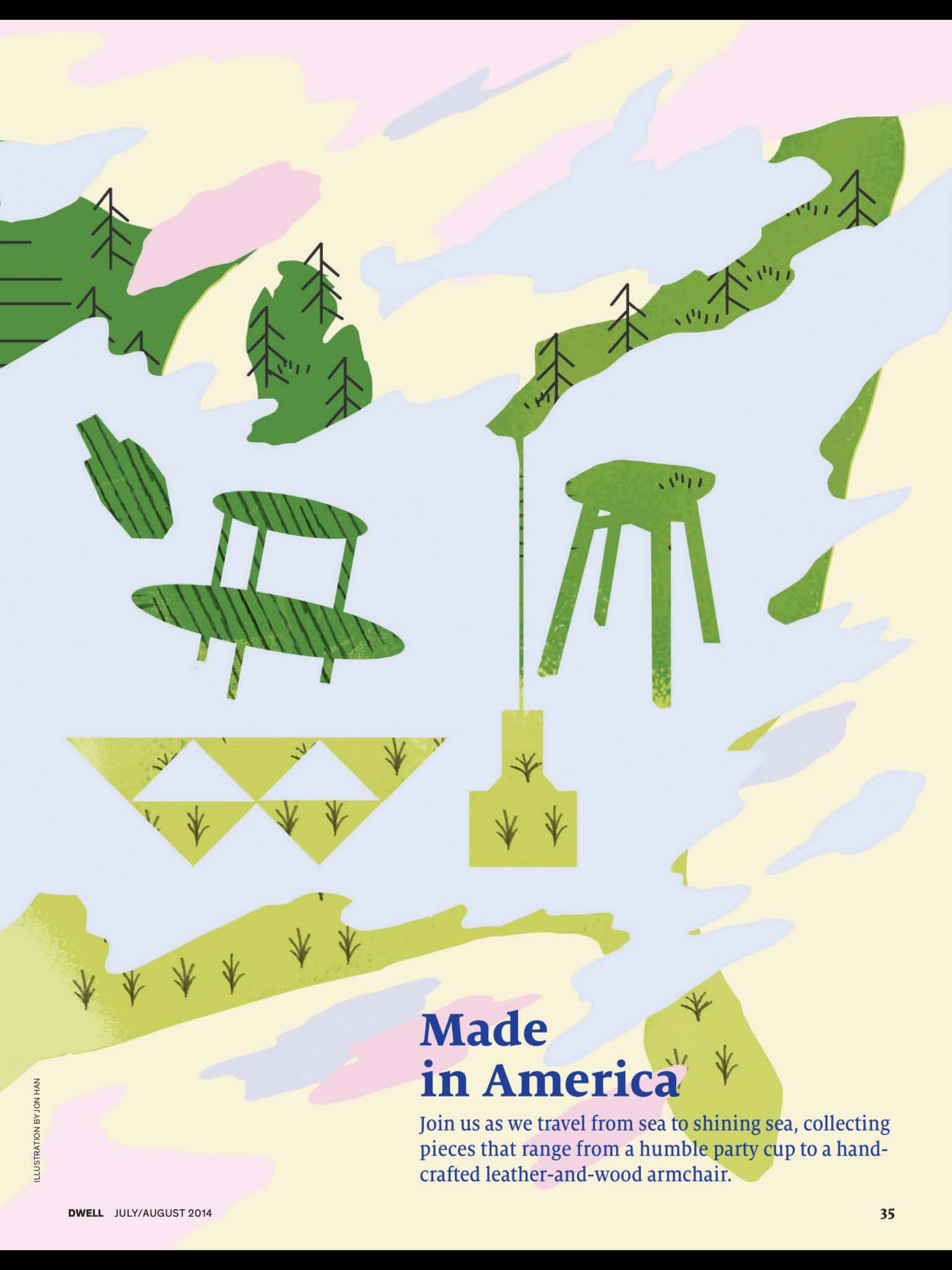
ILLUSTRATION BY JON HAN