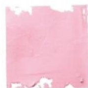
BABY'S BLANKET by Dunn Edwards dunnedwards.com