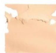
SWEET MELON by Glidden glidden.com