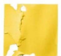
CUT CITRINE by Ralph Lauren ralphlaurenpaint.com