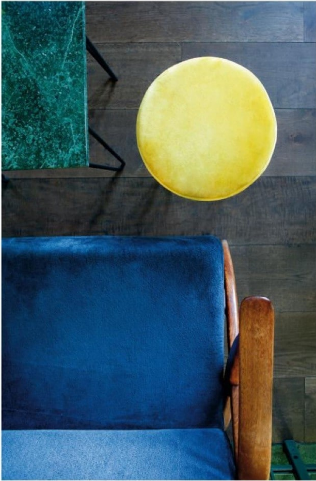
Vintage furnishings, jewel tones with hints of bright pink and yellow, and lots of sculptural greenery give Bar Botanique its eclectic vibe.