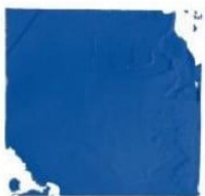
TWILIGHT BLUE by Benjamin Moore benjaminmoore.com