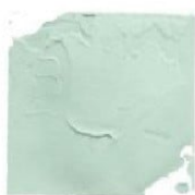
ALOE by HGTV Sherwin Williams sherwin-williams.com