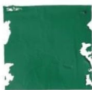
SPARKLING EMERALD by Behr behr.com