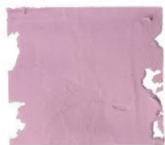
DAWN'S REVEAL by Valspar valsparpaint.com