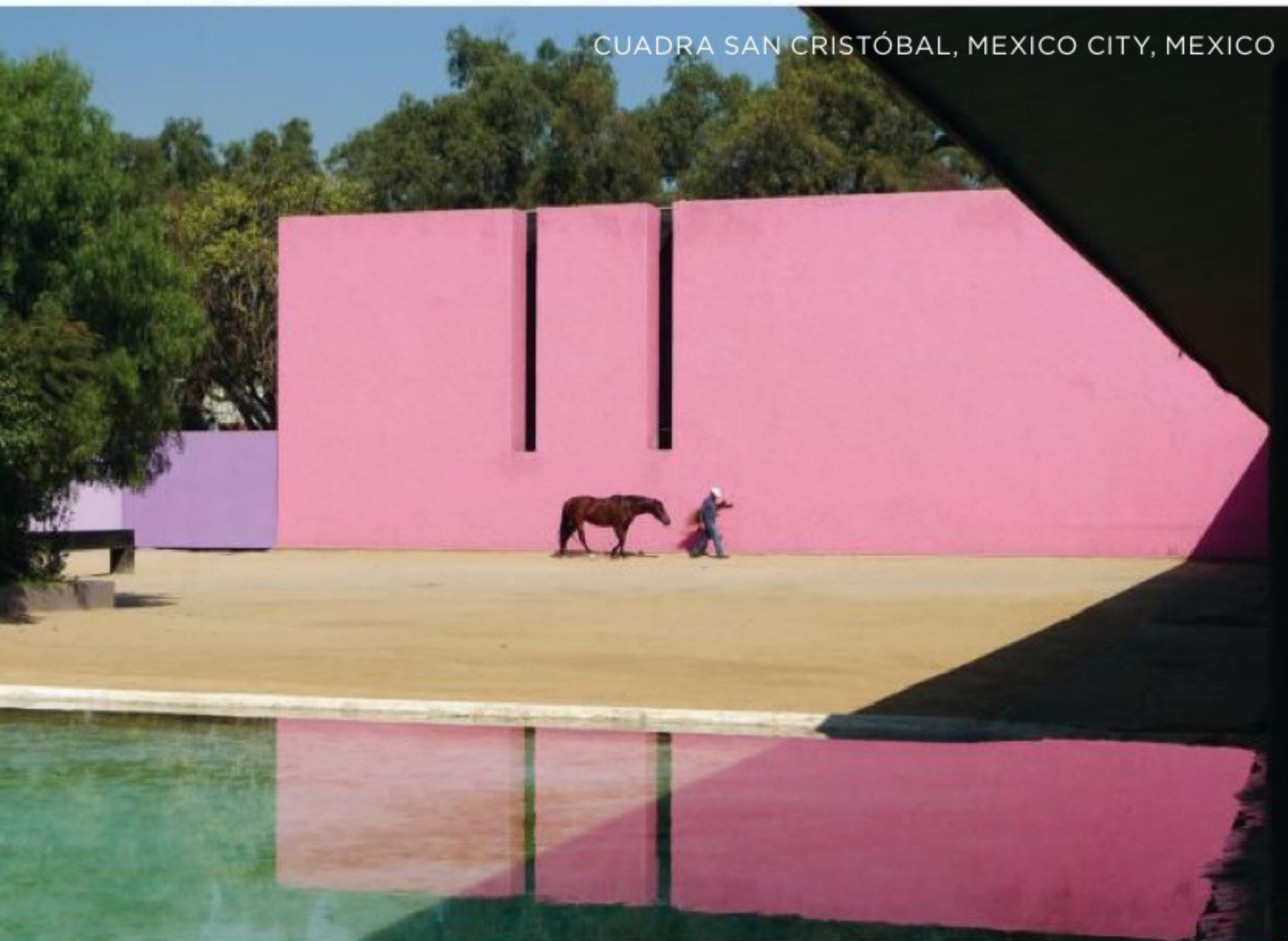
CUADRA SAN CRISTÓBAL, MEXICO CITY, MEXICO