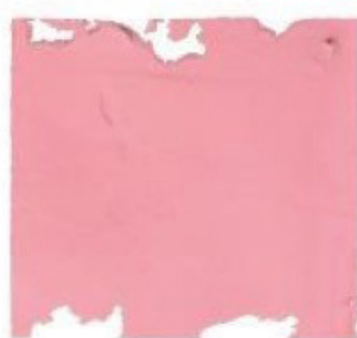
SWEET SIXTEEN by Valspar valsparpaint.com