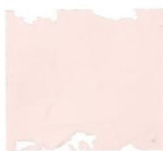
PEACHY KEEN by Dunn-Edwards dunnedwards.com