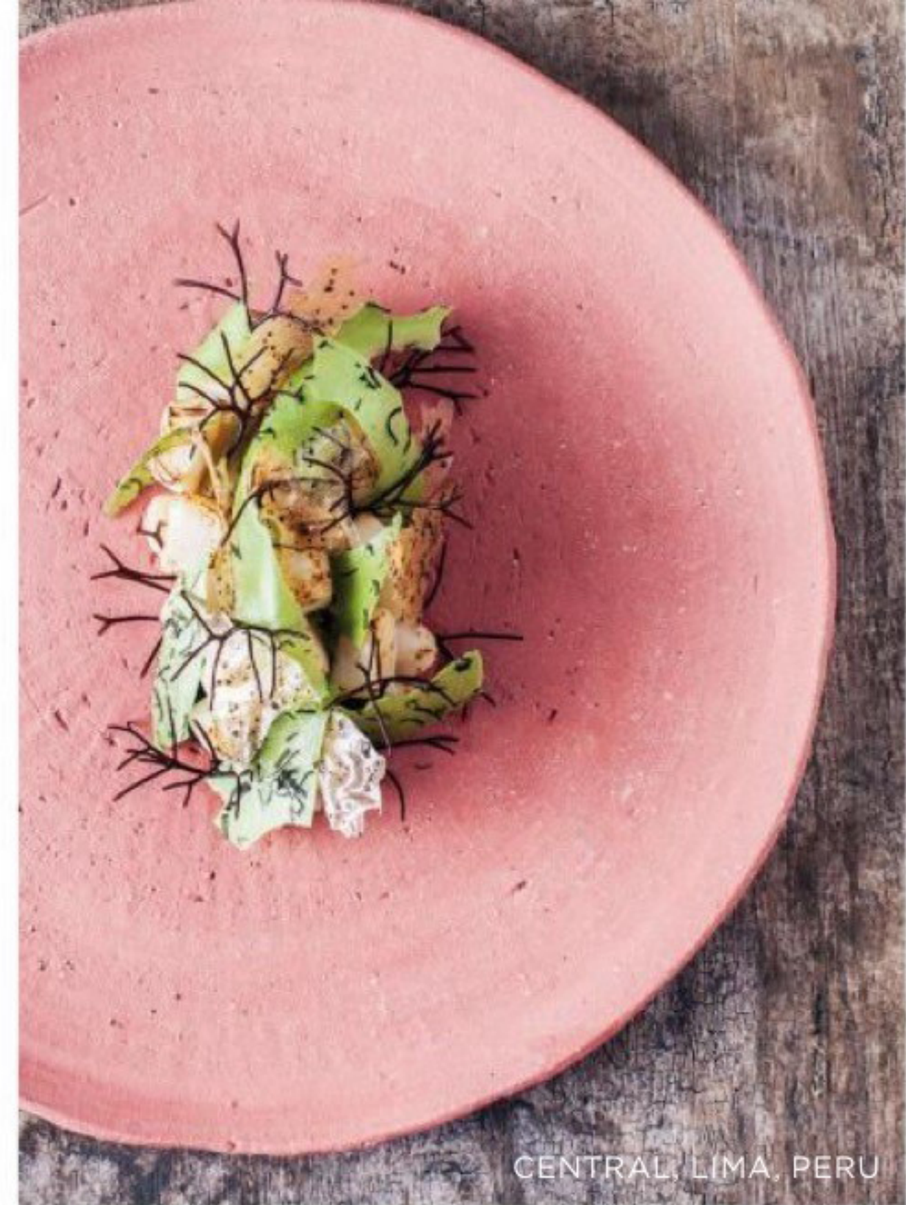
CENTRAL LIMA, PERU

The color of springtime blossoms and sweet confections, pink is the paler sister of red—but just as statement making. Whole cities are awash in the rosy hue, such as the ornate sandstone structures of Jaipur and the pink-plaster buildings of Marrakech. When the shade pops up in nature, it's even more surreal: In Australia, Senegal, and Spain, salt lakes boast waters resembling melted strawberry Creamsicles. Pink is a favorite of designers and architects, too, from the soft pastels of India Mahdavi's Sketch restaurant in London to the striking magenta of Luis Barragán's Cuadra San Cristóbal equestrian estate just outside Mexico City.