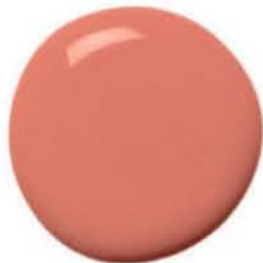
CORAL PASSION VALSPAR