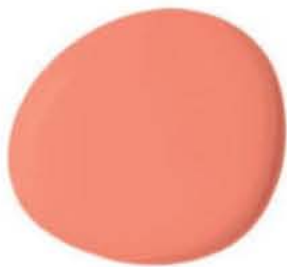
ORANGE AURA DUNN-EDWARDS PAINTS