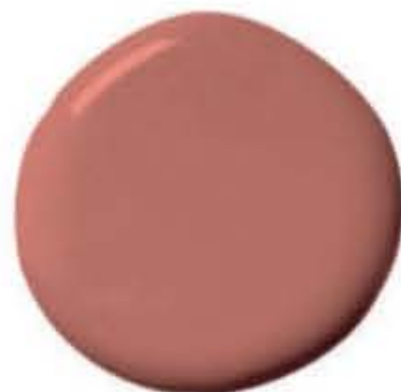
SAVANNAH C2 PAINT