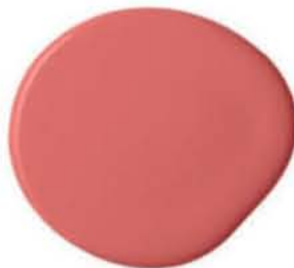
CHA CHA CHA CLARK+KENSINGTON/ ACE PAINTS