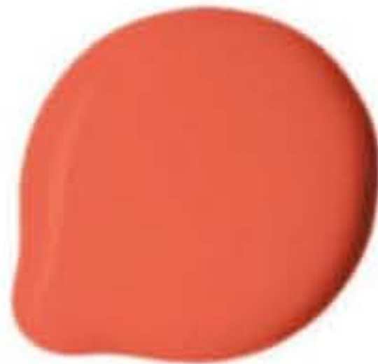
PICANTE BENJAMIN MOORE